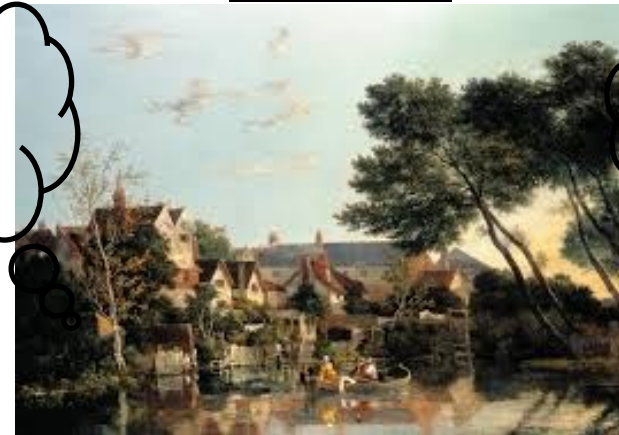
Norwich River: Afternoon, c.1812-1819, by John Crome