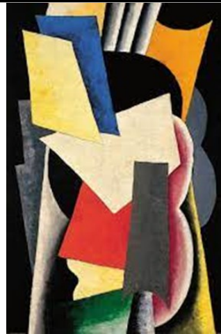
Lyubov Popova- Painterly Architectonic (Still life: Instruments) 1915

Be able to comment on other people's art-work constructively.