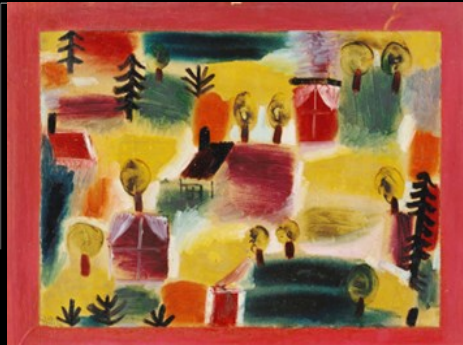
Paul Klee Village Landscape 1919